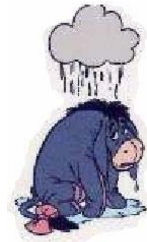
I'm dripping with enthusiasm!

“Till I come, give attendance to reading, to exhortation, to doctrine.” 1 Tim. 4:13