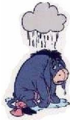
I'm dripping with enthusiasm!

“Till I come, give attendance to reading, to exhortation, to doctrine.” 1 Tim. 4:13