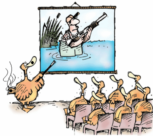
Re-peath afther me, "Bad, Bad, Bad! "

Memorable words are repeated, Copy-able actions are reproduced.