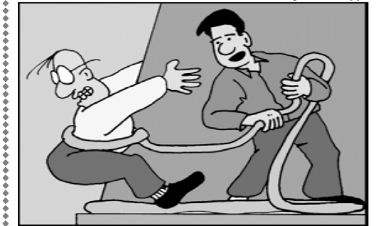
"Didn't I tell you bungee jumping would bring in a bunch of kids for Vacation Bible School?"

"Any belief worth having must survive doubt"