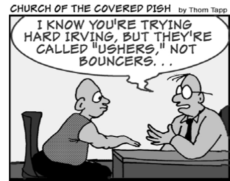
Another good reason to have new member training.

As Christians our "environment" is "The Kingdom of God," and the "standard" is "The Word of God."