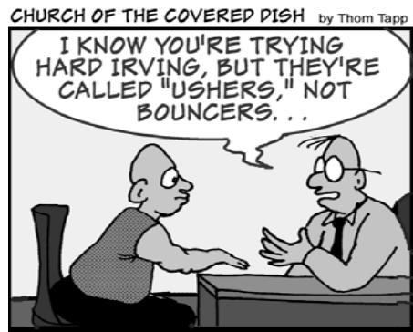
Another good reason to have new member training.

As Christians our "environment" is "The Kingdom of God," and the "standard" is "The Word of God."